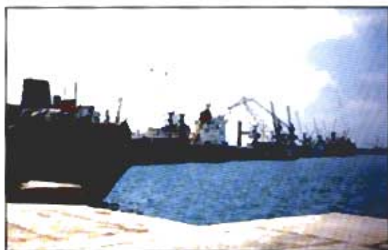
€ 50 million, EIB's loan to modernization of Tartous port

During the year, there was considerable progress on existing loans covering the electricity and healthcare sectors.