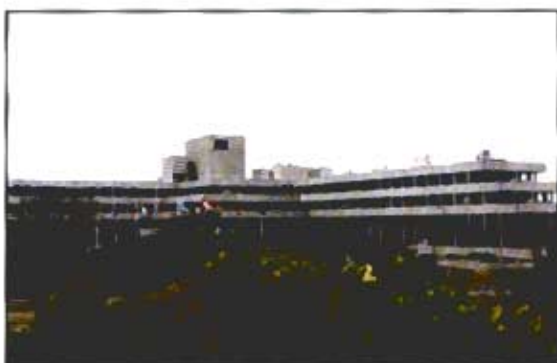
EIB's Building, Luxembourg

All EIB loans in Syria are coordinated with the